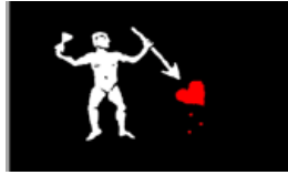
J. Quelch Flag 3x5' #FP-37