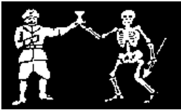
Bart Roberts Flag 3x5' #FP-017