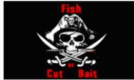
Fish or Cut Bait (New) Flag 3x5' #FP-046