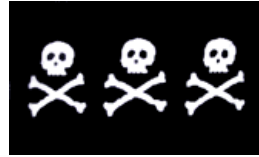
C. Condent - 3 Skulls Flag 3x5' #FP-34