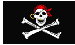
Gold Teeth Pirate Flag 3x5' #FP-53