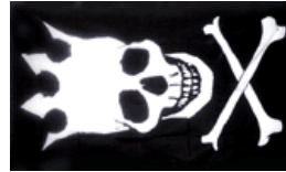
The Skull With Crown-Flag 3x5' #FP-27