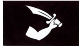
Pirate Thomastew Flag 3x5' #FP-49