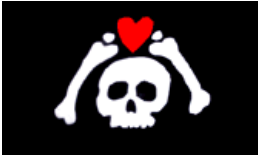
Microprose Flag 3x5' #FP-29