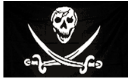
Skull & Two Swords Flag 3x5' #FP-014