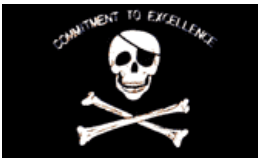
Commitment to Excellence Flag 3x5' #FP-006