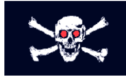
Red Eyes Flag 3x5' #FP-015