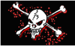
Blood Pirate Flag 3x5' #FP-50