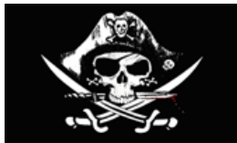
Deadman Chest Tricorner Flag 3x5' #FP-02