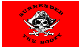
Surrender The Booty (Red) Flag 3x5' #FP-51