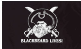
Black Beard Lives Flag 3x5' #FP-003