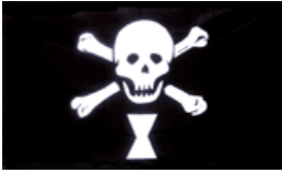
Emanuel Wynn Flag 3x5' #FP-36