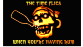
Pirate Rum Flag 3x5' #FP-044