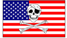
USA Pirate Flag 3x5' #FP-039