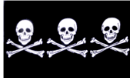
3 Skulls and Crossbones Flag 3x5' #FP-32