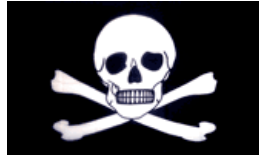
Poison New Flag 3x5' #FP-38