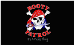
Booty Patrol Flag 3x5' #FP-55