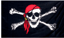
Red Bandanna Jolly Roger Flag 3x5' #FP-012