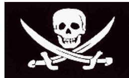
Jack Rackham Flag 3x5' #FP-009