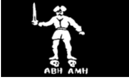
Black Bart Roger Flag 3x5' #FP-040