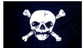
Big Skull Flag 3x5' #FP-005