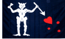
Edward Teach Flag 3x5' #FP-043