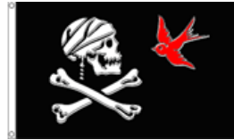
Pirate Sparrow Flag 3x5' #FP-56