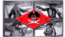
Pirate Capitans Flag 3x5' #FP-22