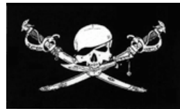
Brethren of the coast Flag 3x5' #FP-004