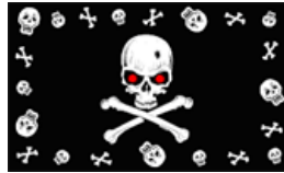
Skull and skull red eyes Flag 3x5' #FP-19