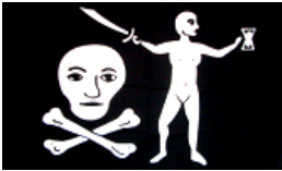
Pirate Dullen Flag 3x5' #FP-011