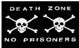
Death Zone Flag 3x5' #FP-007