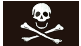
Jolly Roger (Poison) Flag 3x5' #FP-010