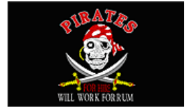
Pirates For Hire Flag 3x5' #FP-54