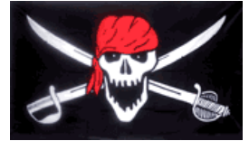
Brethren - Red Head Wrap Flag 3x5' #FP-28