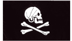
henry Avery Flag 3x5' #FP-016