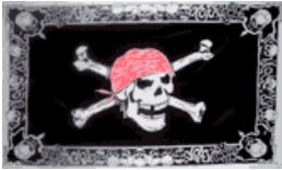
Skull With Skull Border Flag 3x5' #FP-24