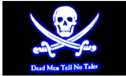
Dead Men Tell No Tales Flag 3x5' #FP-018