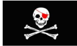
Pirate (Red eye patch) Flag 3x5' #FP-077