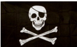
Pirate (Regular) Flag 3x5' #FP-001