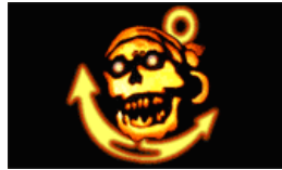
Pirate Anchor Flag 3x5' #FP-047