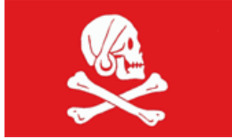
Henry Avery (Red) Flag 3x5' #FP-041