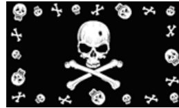
Skull and Bones Flag 3x5' #FP-048