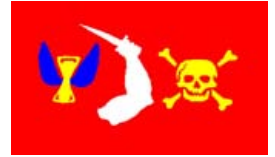
Cmoody Flag 3x5' #FP-35