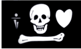
Stede Bonnett Flag 3x5' #FP-30